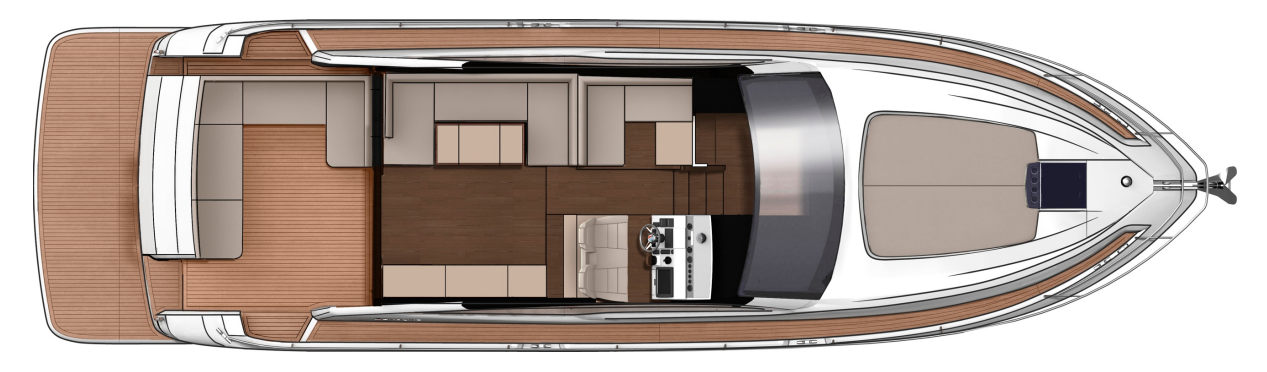
Main Deck Galley Up (option)